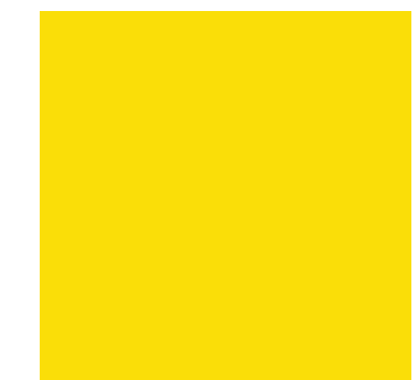
#F9DD08 C4 M8 Y100 K0