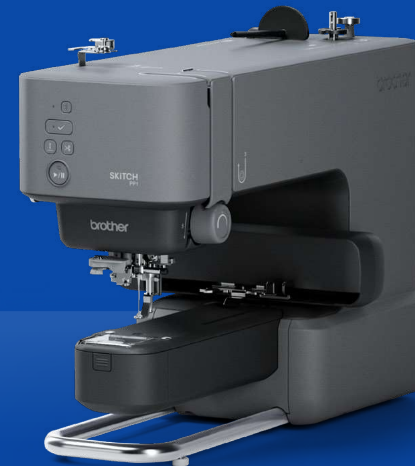
Both images layered to give a more realistic shadow on any background