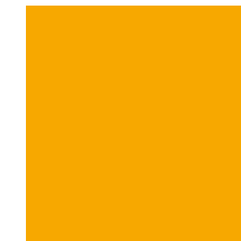
#F8A800 C0 M41 Y100 K0