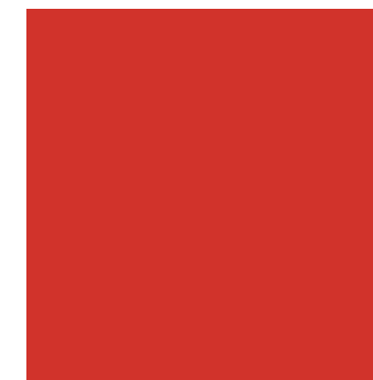
#D0322B C5 M100 Y100 K0