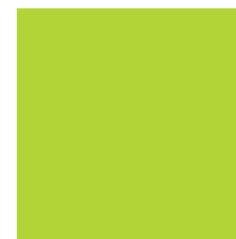
#B2D235 C40 M0 Y100 K0