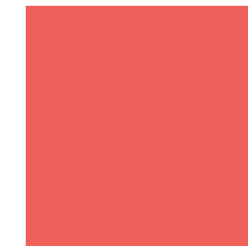
#EF605D C0 M82 Y60 K0