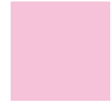
#F4C1D8 C0 M32 Y0 K0