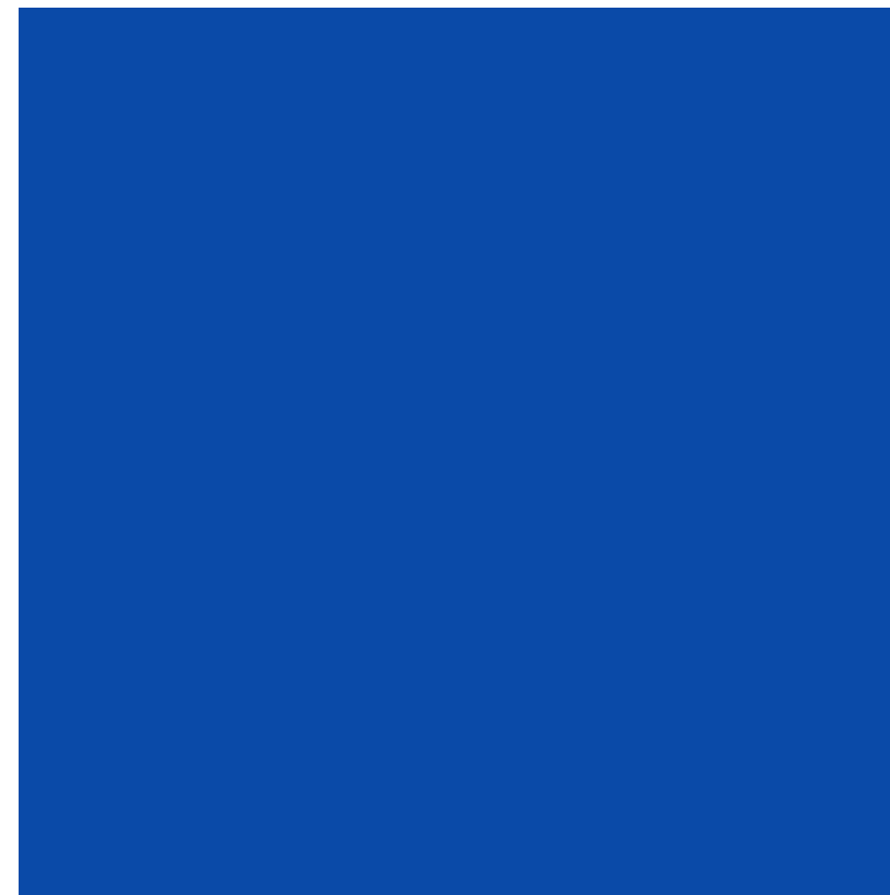
Skitch Background Blue #0A4BA8 C99 M79 Y0 K0

The colours should only be reproduced using the values shown here: hex for on-screen and CMYK for print.