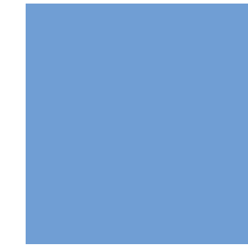
#6F9ED4 C60 M27 Y0 K0